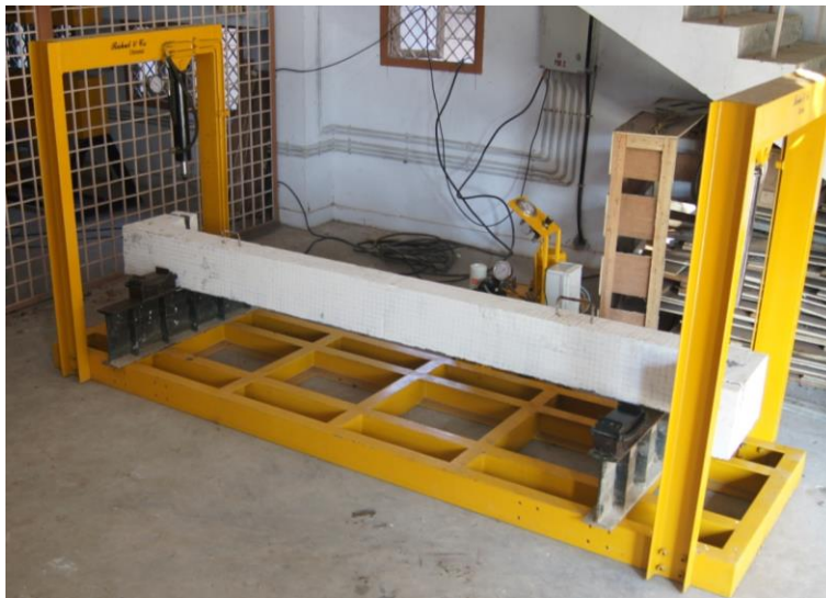
Fig.3.10 Torsion Testing Equipment